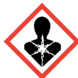
New Health Hazard Pictogram (Symbol)